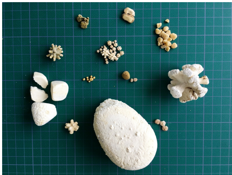
Figure 1. Different types of uroliths. Note the differences in shape, size, color, and number; however, none of these characteristics is specific to a particular mineral composition.