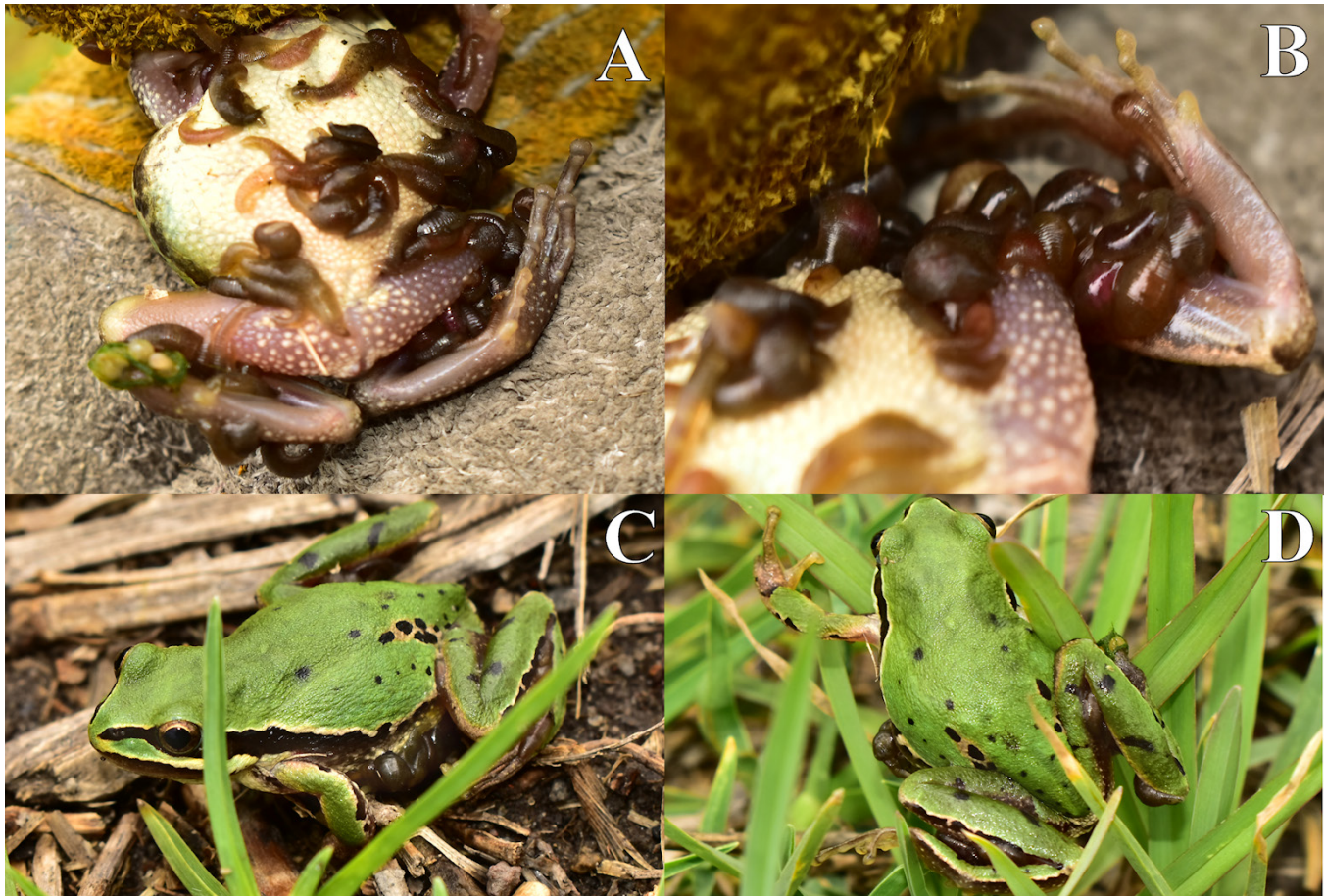
Figure 2. A y B) Sanguijuelas depredando a Hyla eximia , la mayor carga parasitaria se observa del lado izquierdo de la rana, C y D) rana liberada del canal aún con sanguijuelas adheridas, como el organismo no podía escapar, permaneció inmóvil por un largo período de tiempo.

After rescuing the Hyla eximia individual, we observed that it was an adult female with a snout-vent length of 30 mm. We noted a high number of leeches attached to its ventral side, specifically its belly and extremities (65 leeches), with a greater concentration on the left side (41 leeches; see Fig. 2A, B). Upon release, the frog exhibited an obvious difficulty in locomotion, moving in short, paused jumps (see Fig. 2C, D). Some leeches fell off the frog during handling and forced displacement. The leeches were identified by taking samples of the Hirudinea to the Instituto de Biología, Universidad Nacional Autónoma de México for its identification, belonging to the Helobdella genus (Oceguera-Figueroa pers. comm.). In Mexico, there are seven recorded species of Helobdella , namely H. atli , H. elongata , H. modesta , H. octatestisaca , H. socimulcensis , H. temiscoensis , and H. virginiae (Oceguera-Figueroa & León Rêgagnon, 2014; Salas-